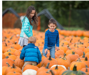
PUMPKIN PATCH AND CORN MAZE