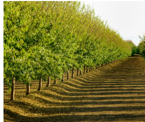
ORCHARD AND GARDENS