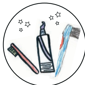
TOOTHBRUSH & TOOTHPASTE