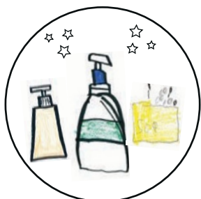
SHAMPOO & BAR SOAP