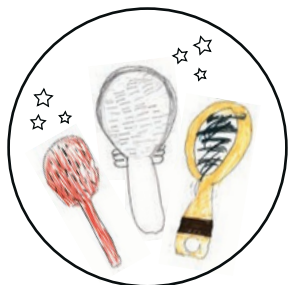
HAIRBRUSH & COMB