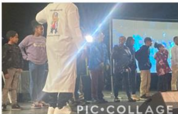
Holiday Attire Dress Down and Hot Cocoa Bar