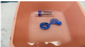
5. Rinse the spacer parts in clean water.