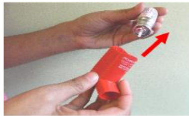
2. Take the canister out of the plastic inhaler cover.