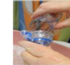
Spacer with mouthpiece 3. Twist off the front part of the spacer.