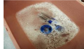
Spacer with face mask 4. Soak the spacer parts in mild, soapy water for 15 minutes.