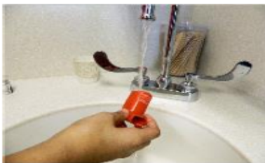
4. Hold the top of the inhaler cover under warm water for 30 seconds.