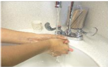
1. Wash your hands.

Follow the steps below to clean your inhaler.