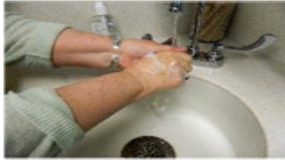
1. Wash your hands.

Follow the steps below to clean your spacer.