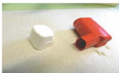
8. Place the cleaned parts of the inhaler on a paper towel and let air dry.