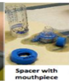
Spacer with mouthpiece 7. Let spacer parts air dry on a paper towel. Stand spacer up to dry. Do not dry your spacer with a cloth towel because it can leave lint in the spacer.