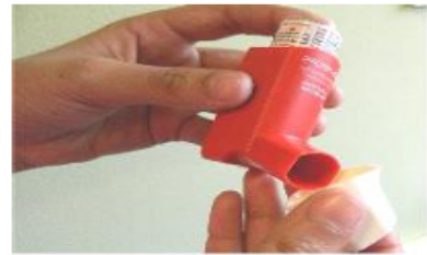
3. Take the cap off of the inhaler.