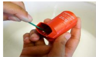
6. If needed, use a toothpick to scratch off any hardened medicine from the small hole in the inhaler cover.