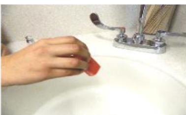
7. Shake off any water on the inhaler cover.