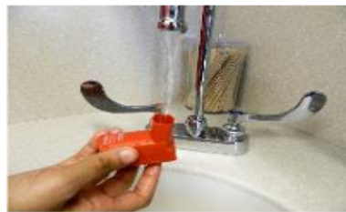
5. Turn the inhaler cover upside down and run the bottom under the warm water for 30 seconds.