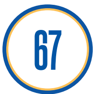
Number of diploma candidates registered in the session