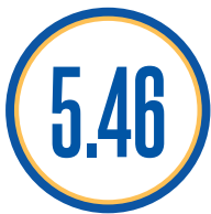
Average grade obtained at the school by candidates who passed the diploma