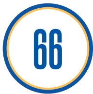
Number of candidates who successfully passed the diploma