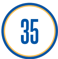
Average points obtained by candidates who passed the diploma