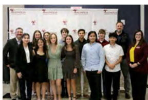
MWHS College Board Honor Recipients