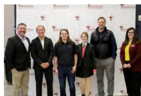
MWHS National Merit Commended Scholars