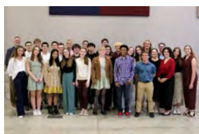
MHS College Board Honor Recipients