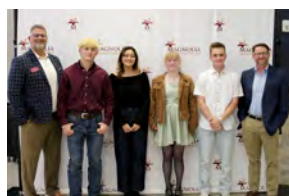
MHS National Merit Commended Scholars