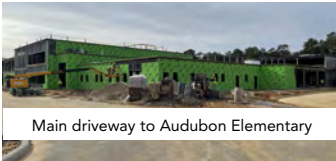
Main driveway to Audubon Elementary

The November 2022 Bond included three new schools as well as additions and renovations to existing career and technical education buildings, NJROTC buildings, and the ag barn. All projects are running ahead of schedule and more information can be found in our Bond newsletter posted on the Bond 2022 page of our website.