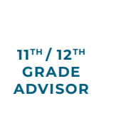
11TH / 12TH GRADE ADVISOR