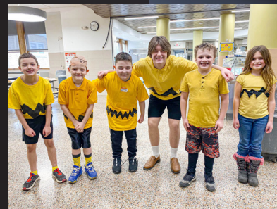
The cast of You're a Good Man, Charlie Brown visited the elementary school during spirit week, which was dress up like the Peanuts gang day.