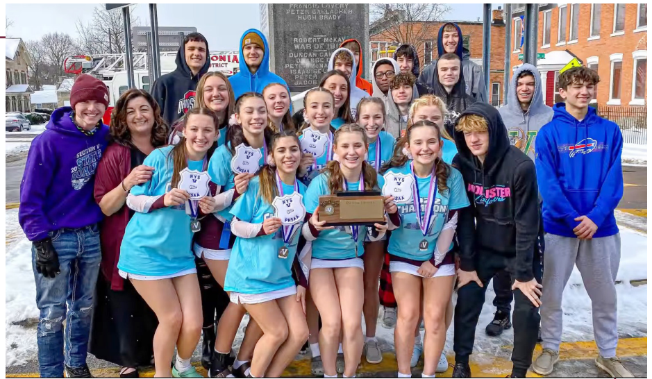
The Raider Boys Basketball players came out to welcome home the Section V Cheer Champions, CM Raiders!