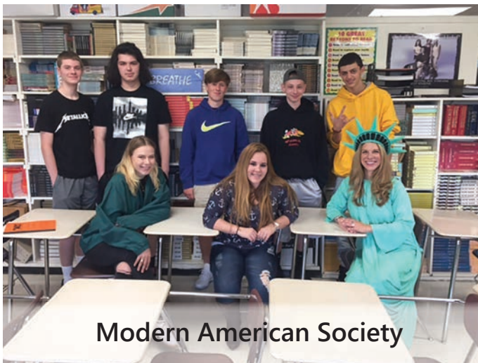
Modern American Society