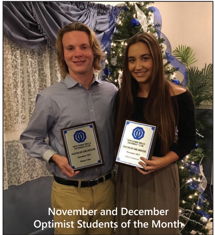
November and December Optimist Students of the Month