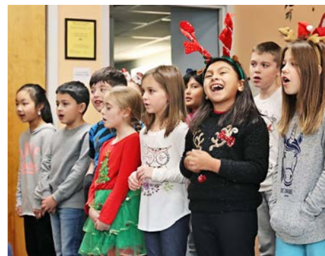
Third graders Christmas caroling