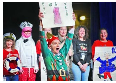
Teachers perform the 12 Days of Christmas