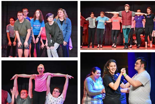
Photos from rehearsal.

The cast and crew have been working since December to bring together a celebration of dance, art and song as we create a time of familiar tunes such as "Anything Goes," "Blow Gabriel," "You're the Top," "Friendship" and many more toe tapping tunes of the 30's.