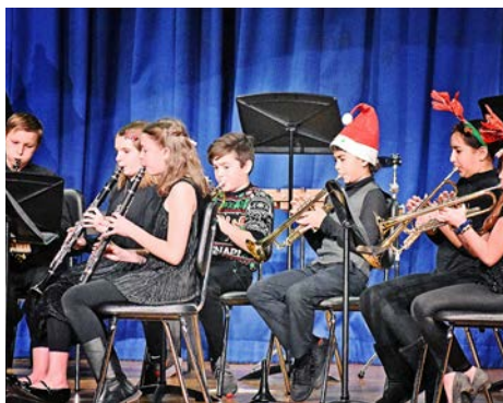
Elementary Holiday Concert