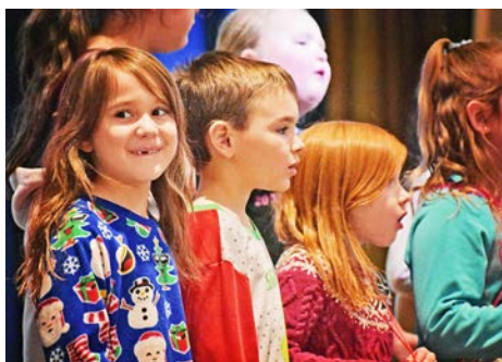
Elementary Christmas Assembly