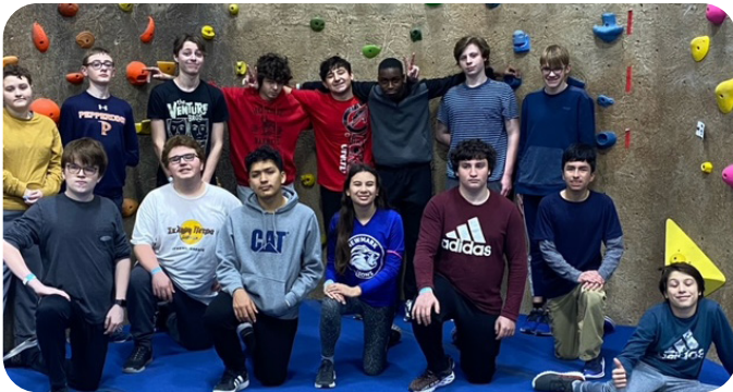
Sophomores on their trip to Gravity Vault in Chatham