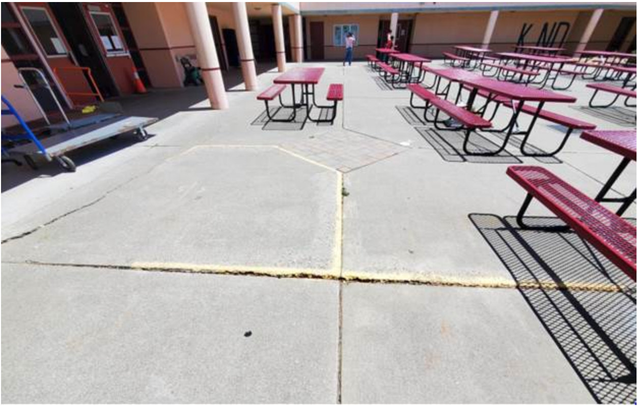
#3 &4 and Brick Paver