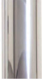
Polished stainless steel