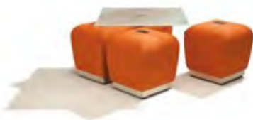
Misto pallet and Clint Club table.