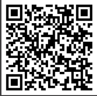
Preliminary Application Form