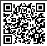
2024-2025 Enrollment Information