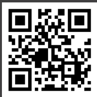
Odyssey ECCO Website

STEP 1: To begin the application process, complete the 2024-2025 Preliminary application form. The link is in step 1 on our website. You must have a valid Google account to log into the application. If you don't have a Google Account, you can create one using the link provided on our website.