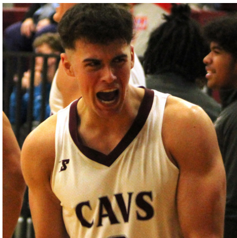
Above: Butler's reaction at the final buzzer tells it all as Crockett improved to 2-6 with the narrow win.