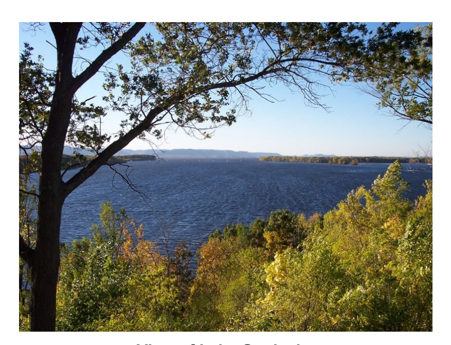
View of Lake Onalaska

To learn more about the community, visit www.cityofonalaska.com or www.explorelacrosse.com