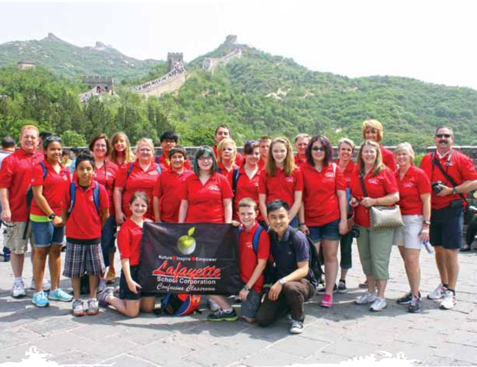
Students of Mandarin Language Program visit partner schools for the first time in LSC history. Pg. 3.

Publication of Lafayette School Corporation SUMMER 2012