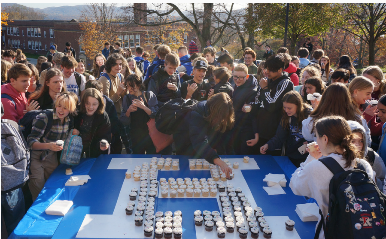
Blue Ribbon celebration at Haldane High School