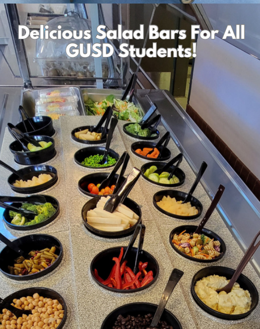
Delicious Salad Bars For All GUSD Students!