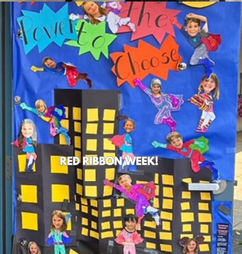
RED RIBBON WEEK!