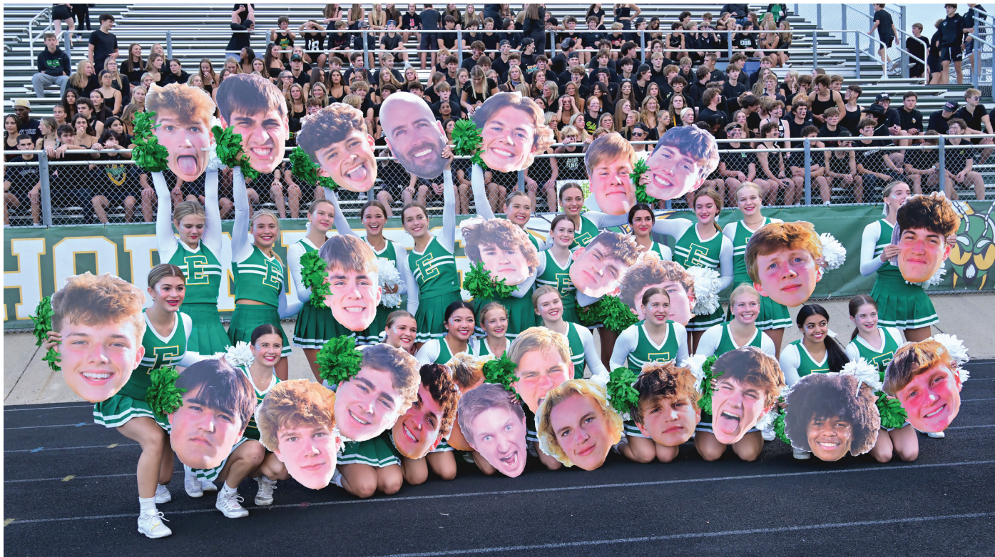
The event was an unforgettable gathering of state titleholders and community. Here, the Edina Cheer Team is captured holding cut out heads of the players of Edina's football team.

Families can enroll in their neighborhood school close to home or in one of our three choice programs: French Immersion, Spanish Dual Language, or Continuous Progress.