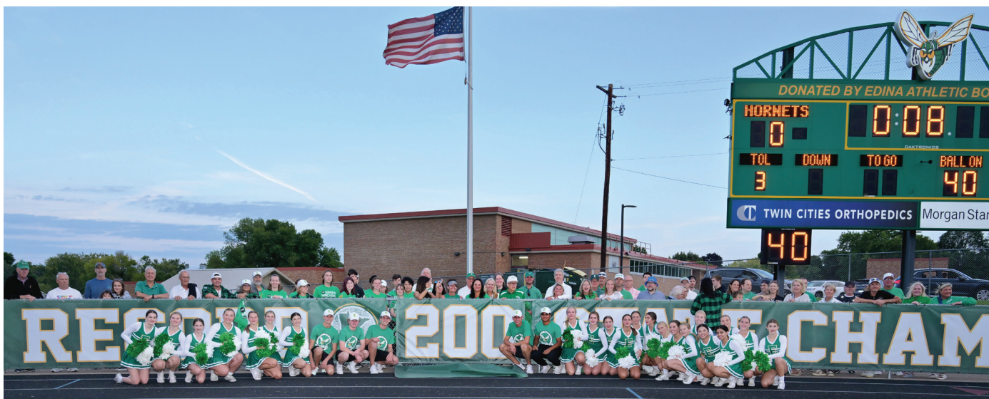
The boys golf team who clinched the 200th title revealed the historic number at the State Title Celebration.

I n a remarkable feat of sports excellence, Edina Public Schools reached an extraordinary milestone in the school's storied history—the achievement of 200 State Championship Titles. This state record was celebrated at the first home football game of the season. Current and past state title recipients, alumni, parents, staff, and students came together for the momentous occasion at Kuhlman Field.