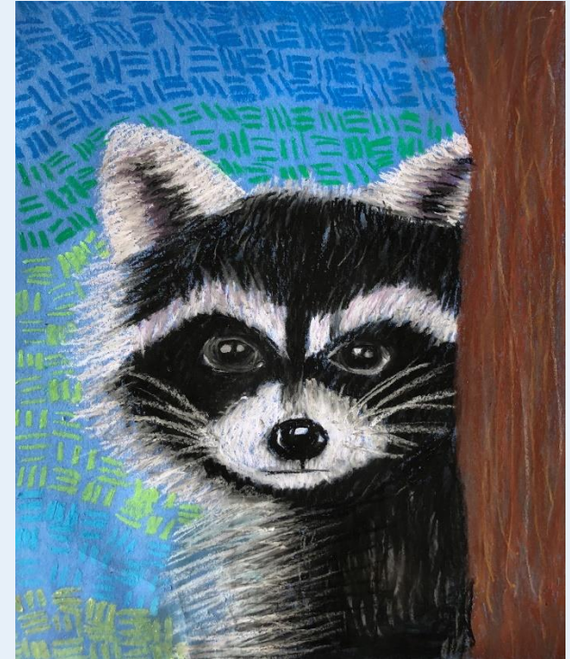
Indraja Sujith Grade 6