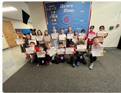
1st grade Revere Ready