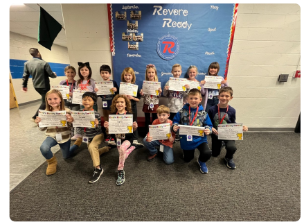
2nd grade Revere Ready