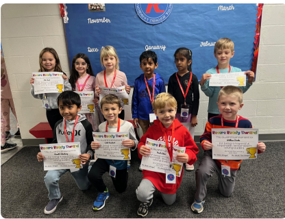
Kindergarten Revere Ready

Thank you all for the support you have shown this year! We couldn't put on all these fun activities at Richfield without the many hours volunteered by our parents, staff, and teachers. We are thankful for you!