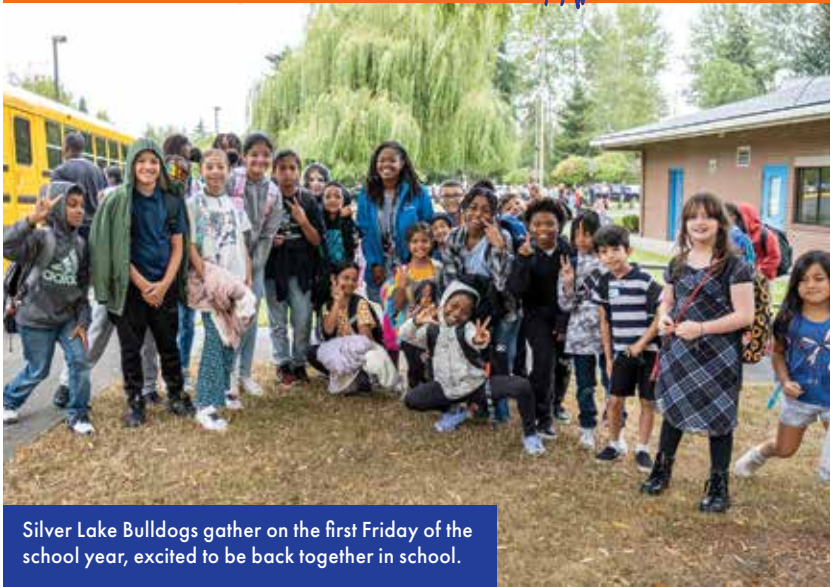
Silver Lake Bulldogs gather on the first Friday of the school year, excited to be back together in school.