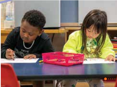
Our youngest learners started their educational journey with preschool! Our families and staff came together to make sure these little ones felt at ease as they started their new adventure. We can’t wait to watch them thrive and grow as scholars in Federal Way Public Schools.

Our school principals present School Improvement Plans each year to outline current data, school goals, and the strategies they will use to help their school community achieve their goals.