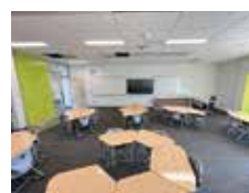
Above, clockwise from upper left: Discovery Lab, Middle School hallway, gym, classroom, Family Connection Center