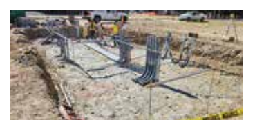
Underground utilities, foundation