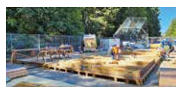
Prefabrication of wood frame walls