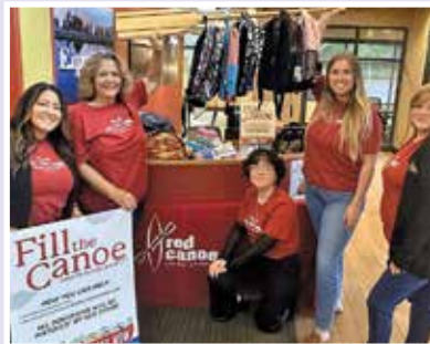
This list reflects donations received September 26, 2023.