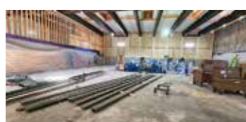
Ongoing work in gym and aux gym

Illlahee Middle School is officially under construction! Much of the tasks currently being completed are in-ground or foundation work, but there has also been a focus on refreshing the gym which will be renewed with updated construction materials, equipment, electrical, and more.