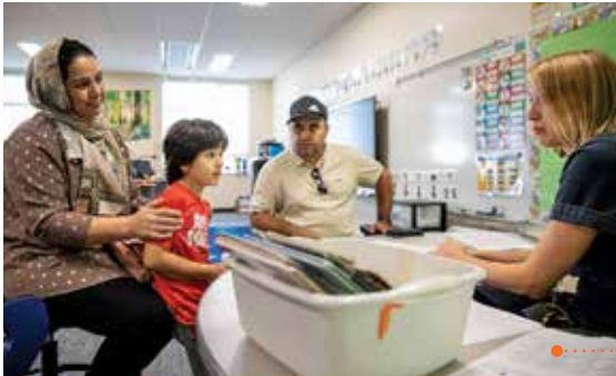
During the first six days of kindergarten, families, teachers and kindergarten scholars participated in Family Connection Conferences to talk about classroom learning and how each party can contribute to a successful school year for their budding scholar.

11th graders in Advanced Placement US History learning about the complexities of national identity and how the United States began defining our collective identity during the founding era. Our 11th grade US History curriculum is new this year and covers major topics in United States history like the American Revolution, the Civil War and Reconstruction, World War II, Modern America, and more.