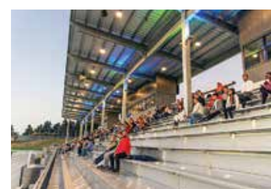
First home game