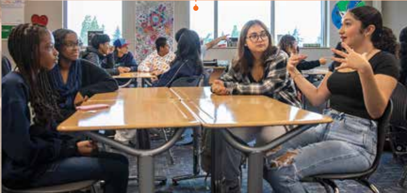
TJHS students engage in conversation about who they want to be, as part of the new social-emotional learning curriculum for middle and high school students, Character Strong. This new curriculum is designed to empower students to help build safe and healthy communities. Lessons are focused on mental health, taking care of each other, being kind, and how to put these skills into practice.