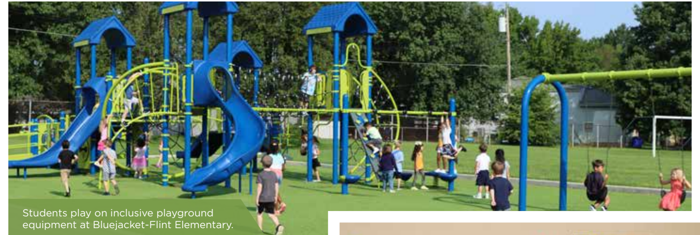
Students play on inclusive playground equipment at Bluejacket-Flint Elementary.

Shawnee Mission is committed to inclusion. This commitment can be seen in the Strategic Plan, as well as in the installation of inclusive playgrounds at the district’s elementary schools.