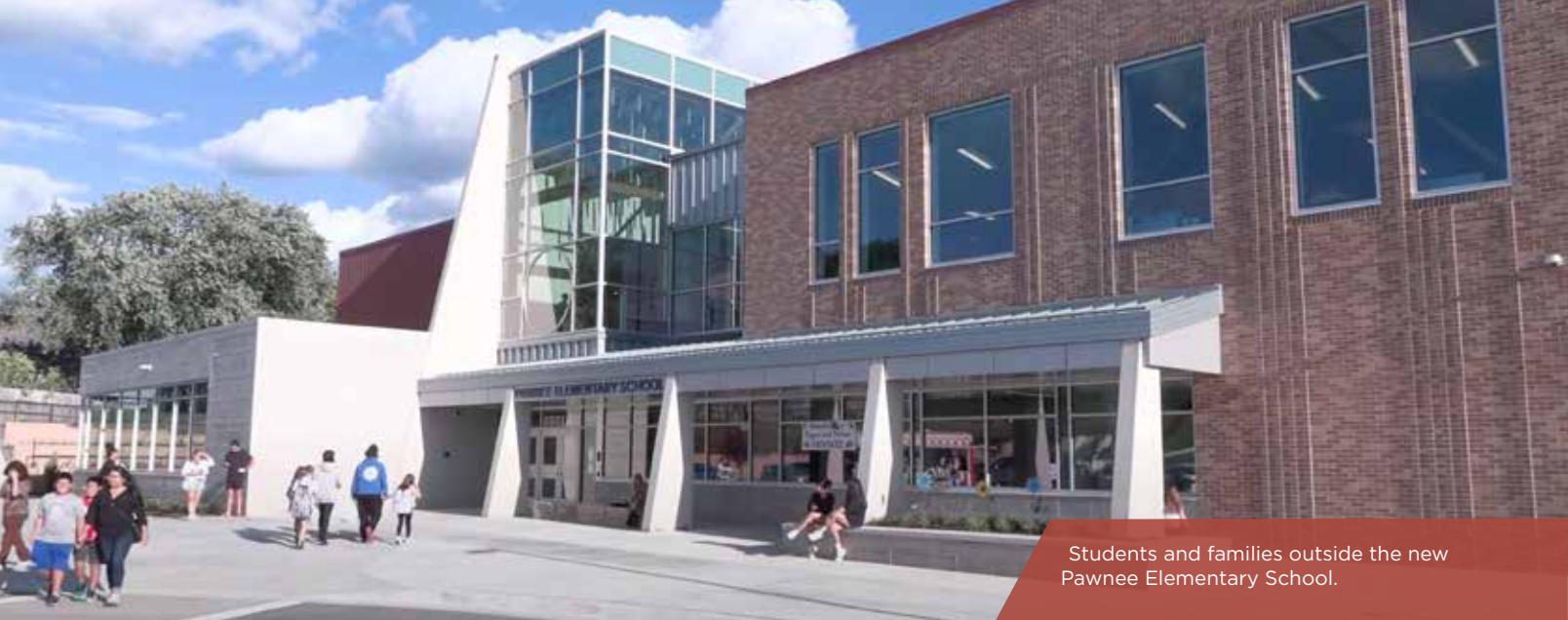
Students and families outside the new Pawnee Elementary School.