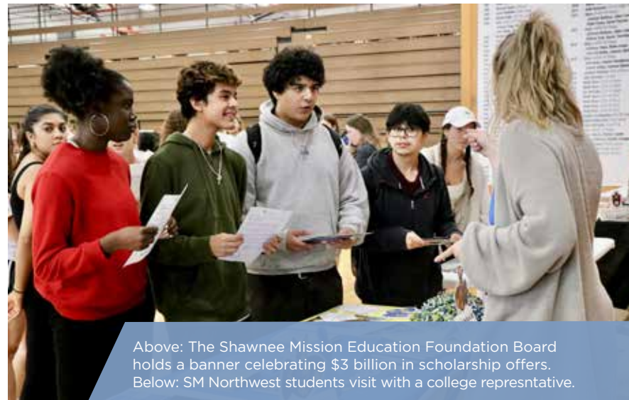
Above: The Shawnee Mission Education Foundation Board holds a banner celebrating $3 billion in scholarship offers. Below: SM Northwest students visit with a college representative.

shine. Moving forward, the goal is to expand further, using technology to link a greater number of Shawnee Mission students to postsecondary options and ensure that opportunities remain accessible to all.