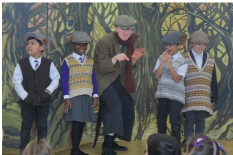
Image Theatre Production

On Wednesday, Image Musical Theatre came to Colnbrook and performed 'Wind in the Willows' to our Reception class and KS1 children. The children helped with the acting and everyone really enjoyed the show!