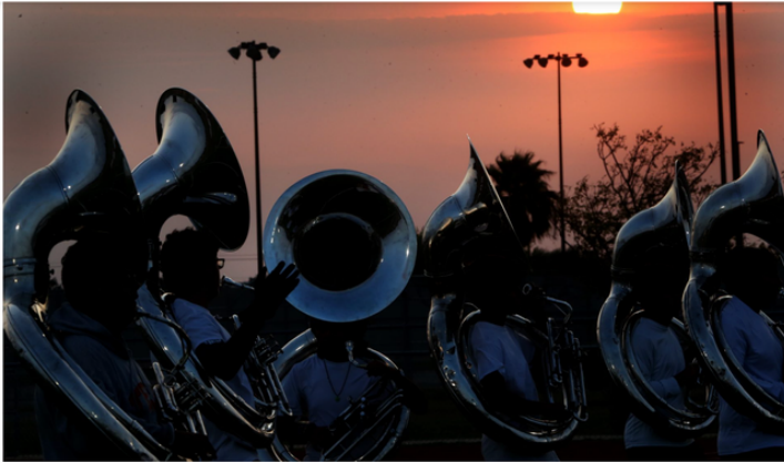
The South Texas sunset silhouettes the PSJA Early College High School marching band during band practice at the school on Monday, Oct. 23, 2023, in Pharr. The band will compete at the University Interscholastic League State Open Class Marching Band Contest Class 6A on Oct. 30 through Nov. 1 at the Alamodome in San Antonio.