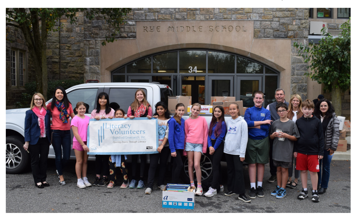
RMS Service Club and Literacy Volunteers show off their donated book haul

In just a few weeks in October, the Rye Middle School Service Club collected approximately 3,000 books to benefit the Literacy Volunteers at Family Centers' Fall Book Fest. Students and families browsed through a huge variety of free books at the annual event, held on October 28. Family Centers is a private, nonprofit organization offering education, health, and human services to children, adults, and families in Fairfield County. To learn more, click <a href="here">here</a>.