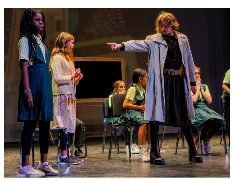
Matilda JR.

RMS captivated audiences in two performances of "Matilda JR. The Musical" on November 18 and 19 at the Rye High School Performing Arts Center. The cast of 46 middle school students was supported by a crew of 8 middle school and 15 high school students. Bravo to the cast and crew!