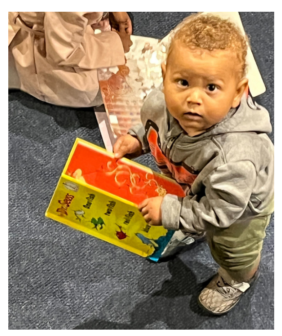
One of Literacy Volunteers' first (and youngest) readers "book browsing"