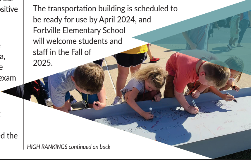
HIGH RANKINGS continued on back

The transportation building is scheduled to be ready for use by April 2024, and Fortville Elementary School will welcome students and staff in the Fall of 2025.