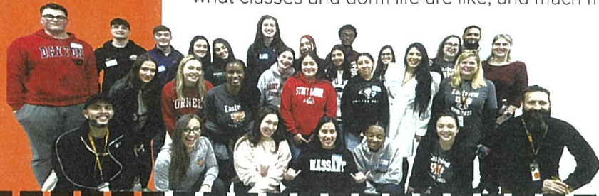
◀ Visiting graduates with White Plains staff and administrators

As part of our mission to ensure all White Plains students are college and career ready, Eastview hosted its schoolwide AVID Steps to Success Program in December, in-person for the first time in three years! About 20 White Plains graduates who are now in college or the military came back to the District to talk with sixth graders about opportunities beyond high school. The visiting alumni answered students' questions about choosing a path after high school, getting ready for college, what classes and dorm life are like, and much more.