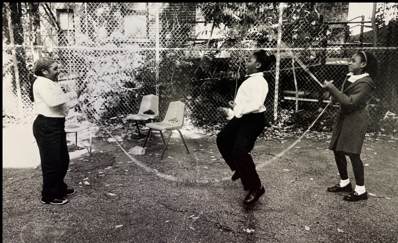
EHS students in 2002