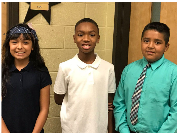
Using the B.E.S.T. Model

B old, R espectful & responsible, I ntelligent, G ifted, H onest, T houghtful team players