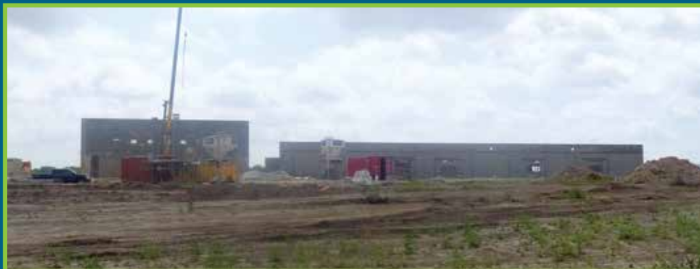
CONSTRUCTION: ELIOT BATTLE ELEMENTARY SCHOOL OPENS IN 2015

The district's transportation facility site renovation is nearing its August completion. Work is being facilitated on a new parking lot, drainage, fencing and renovation of the existing garage and office space, as well as an addition to that space. Total cost will be $2.7 million.