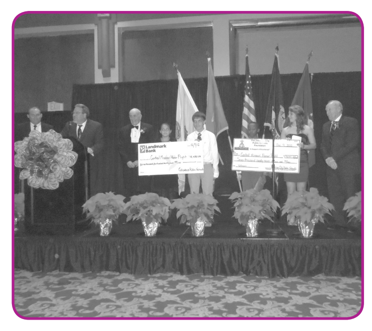
Joint presentation from both Columbia Public Schools and Jefferson City Public Schools at the Central Missouri Honor Flight Honor Ball in December.