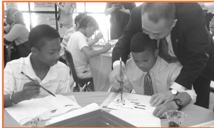
STUDENTS STUDY CHINESE CALLIGRAPHY