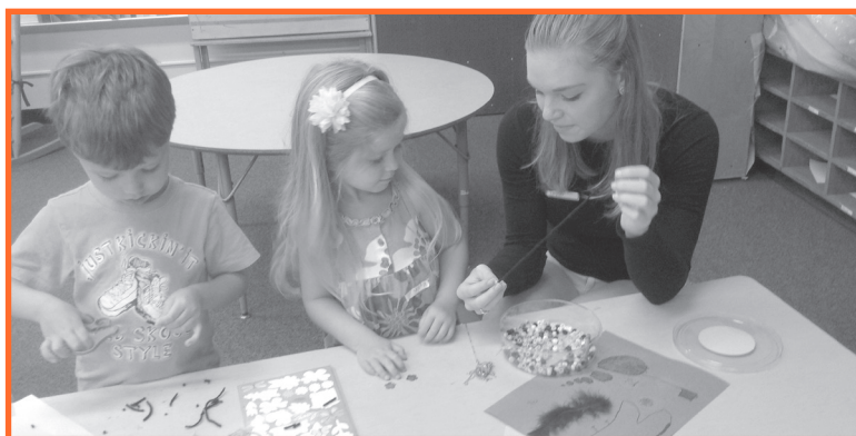
CLASSES SUCH AS "COOKING ADVENTURES WITH BOOKS" AND "OLYMPIC MADNESS" HAVE MADE COLUMBIA PUBLIC SCHOOLS' SUMMER ENRICHMENT PROGRAM A POPULAR DESTINATION FOR STUDENTS.