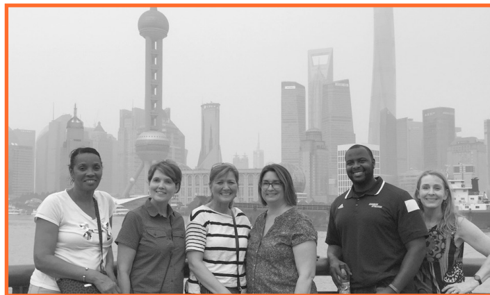
STUDENTS EXPLORE SHANGHAI