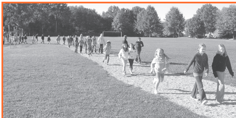
FAIRVIEW ELEMENTARY STUDENTS ENJOY THE SCHOOL'S TRACK FUNDED THROUGH PARKS AND RECREATION