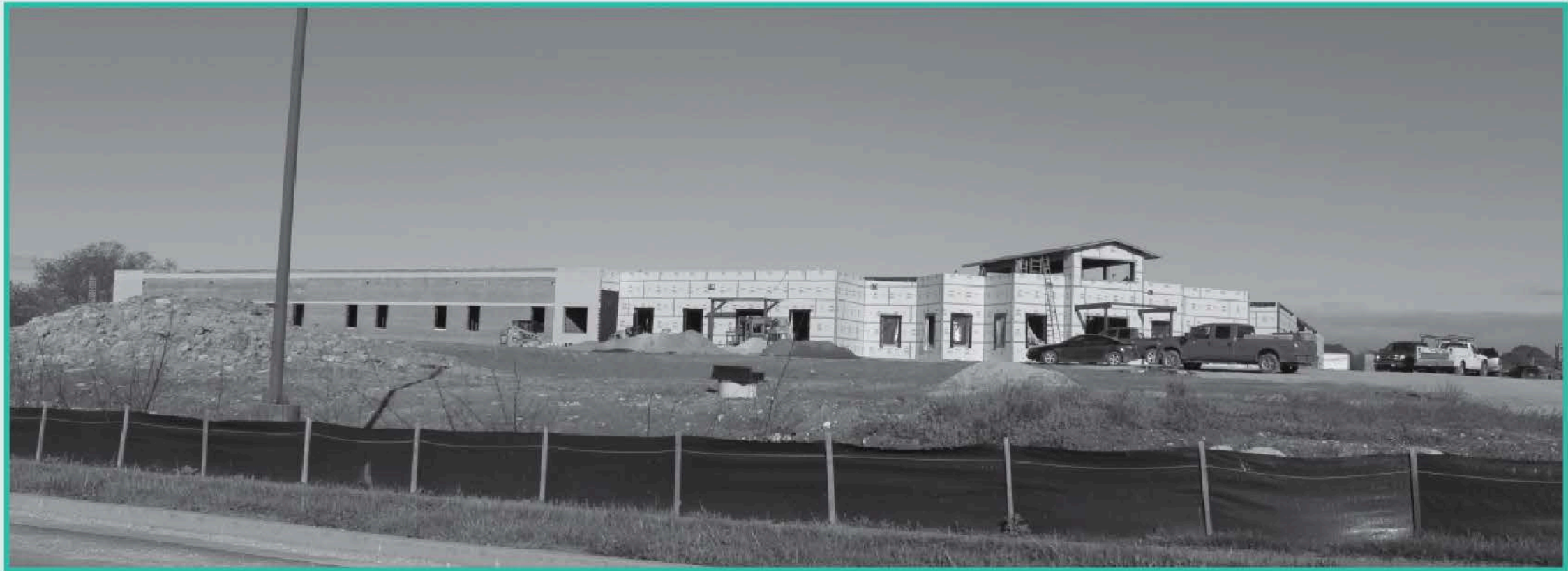
THE EARLY CHILDHOOD LEARNING CENTER, LOCATED NEXT TO LANGE MIDDLE SCHOOL, IS A $9.5 M MILLION PROJECT THAT IS DUE TO BE COMPLETED IN DECEMBER/JANUARY 2017.