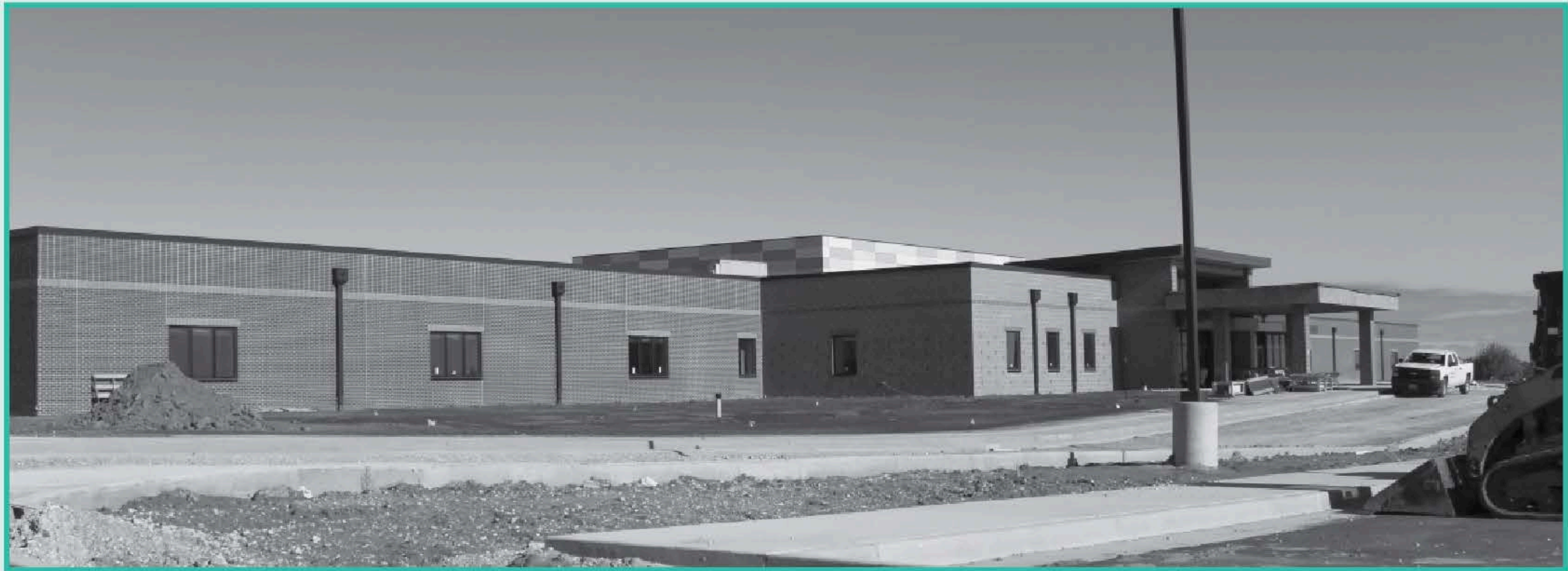
BEULAH RALPH ELEMENTARY SCHOOL NEARS ITS AUGUST COMPLETION GOAL. THE SCHOOL, LOCATED AT THE INTERSECTION OF SCOTT BOULEVARD AND HIGHWAY KK, WAS FUNDED BY THE 2012 VOTER-APPROVED BOND ISSUE AND HAS A TOTAL CONSTRUCTION COST OF ABOUT $20 MILLION.