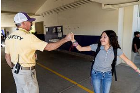
First Day of School at Cooper Academy