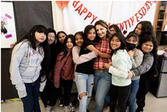
Girl Power Club at Kirk Elementary School