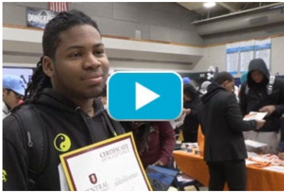
HBCU Caravan Video