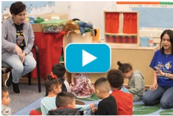
Holland Elementary School Highlight Video