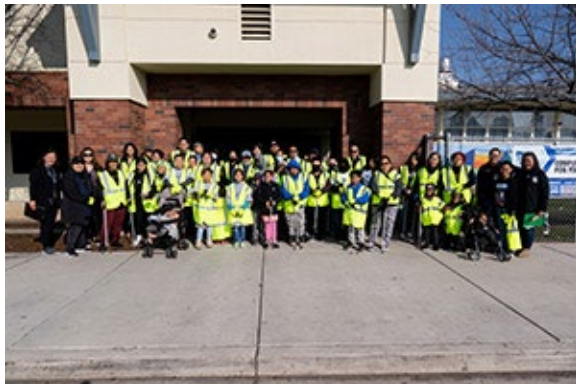
Parent University Community Cleanup at Ewing Elementary School