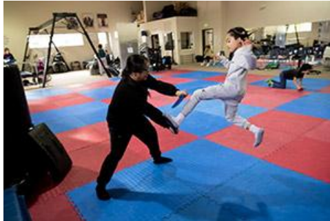
Archery, Taekwondo, Parkour Winter Camp