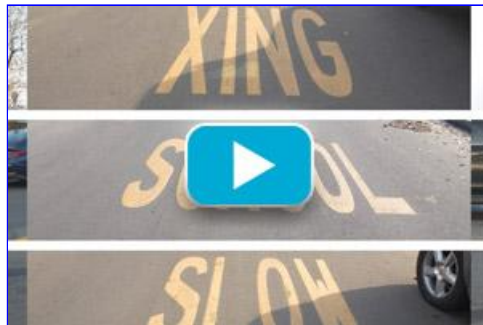
Video of the Week: School Traffic Safety Video