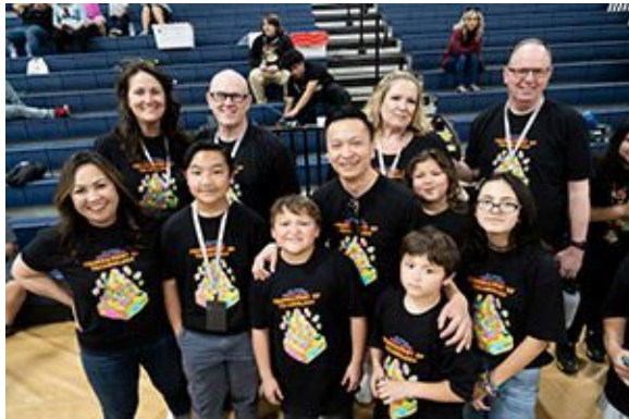
Tournament of Technology