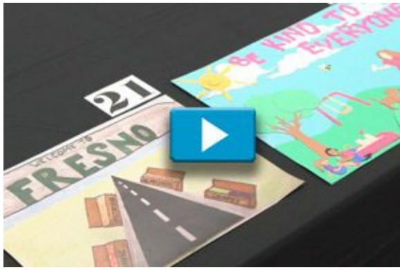
Fresno High Park Art Competition 2023 Video