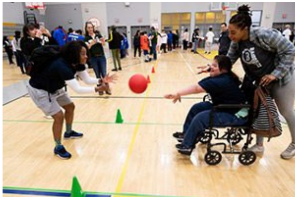
Special Olympics Basketball at Gaston Middle School