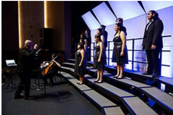
Fresno Unified Choir Festival March 15