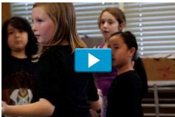
Vinland Elementary School Highlight Video