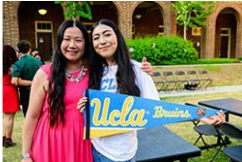
College Signing Day at Design Science Middle College High School