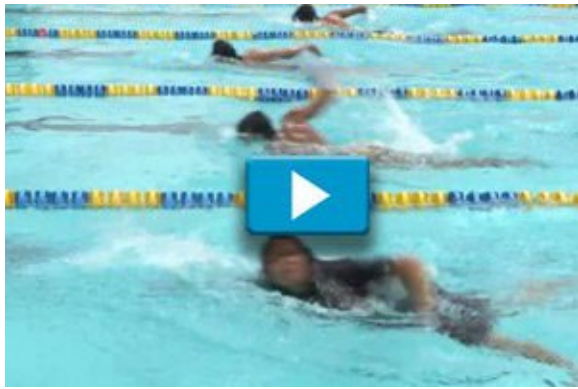
Highlighting P.E. Video