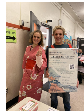
Haiku Holiday Film Faire