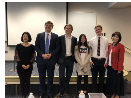
Bay Area HS Speech contest