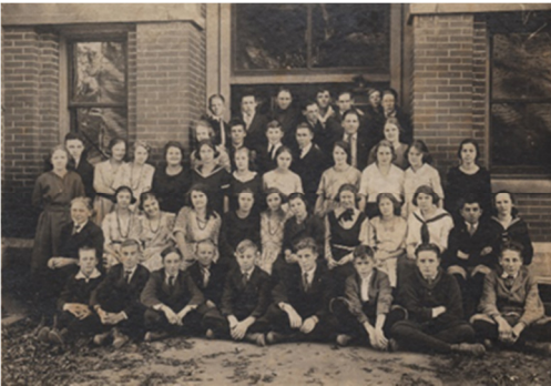
CHS Freshman Class 1921-22

The first seeds of secondary education in Chesterton came in the form of occasional upper-level courses (such as algebra or Latin) offered by the principal of the local grade school. 8 By the early 20 th century, the high school was much more organized, adding such courses as English, agricultural studies, and domestic science. 9 Later, the curriculum was expanded to include music, drawing, and manual training. 10 Graduation ceremonies were first held in Bethlehem Lutheran Church, but they moved to the new high school's auditorium in 1924. 11