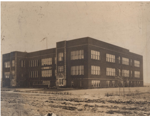
Chesterton High School on Morgan Ave., 1924

That changed in 1924, when a new high school building was constructed at Sixth and Morgan Avenue and housed grades 7-12. In the 1950s and 1960s three additions were made to provide the space and facilities for the growing population. In 1970, the original building was torn down to make room for a new auditorium, swimming pool, and classrooms. 4 The current Chesterton Middle School operates on the land where the original high school stood. 5