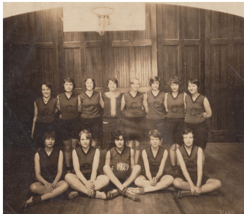
CHS Girls' Basketball Team, 1929

CHS has a long and distinguished history in athletics, as well. In 1923, CHS held its first county basketball competition and