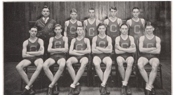
CHS Boys' Basketball Team, 1931