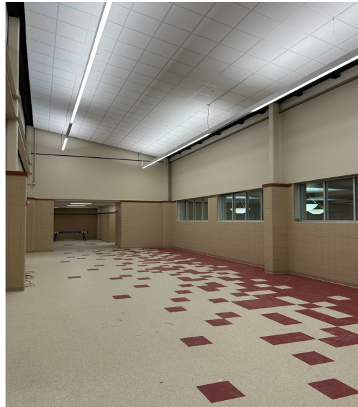
Above Ceiling Work in Unit F - 2 nd Floor