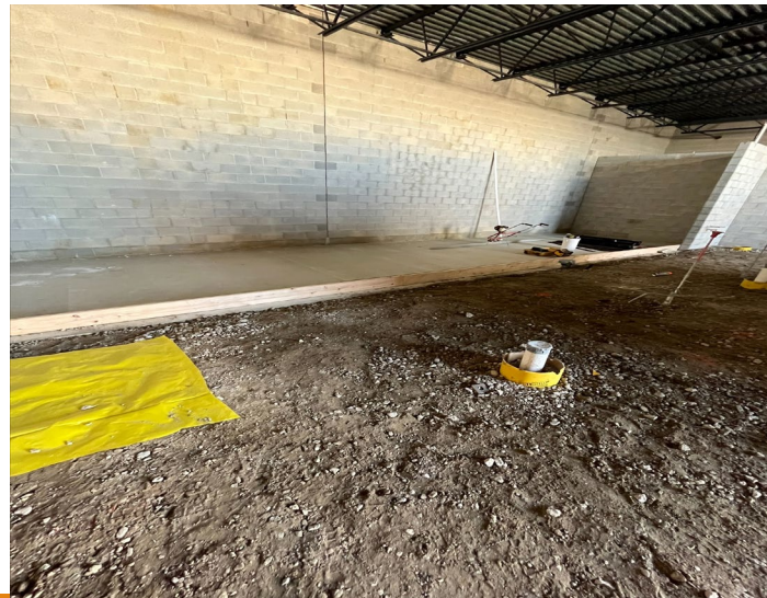
Kitchen Addition Interior Pad