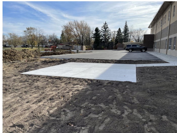
East Parking Lot Paving