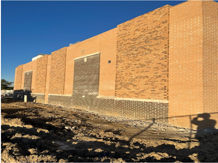
Kitchen Addition West Wall