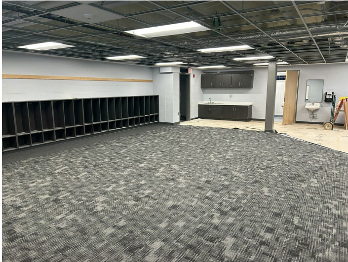
New Kindergarten Classroom