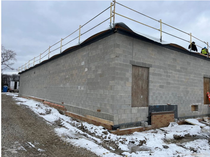
New Classroom Addition