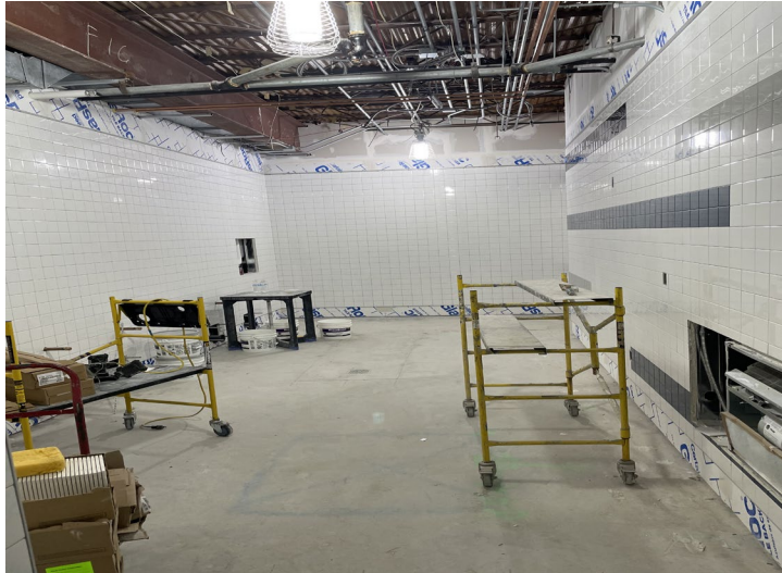
New Bathroom Wall Tile