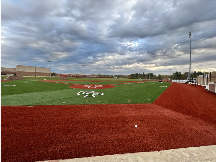
Varsity Baseball Field Turf Installation