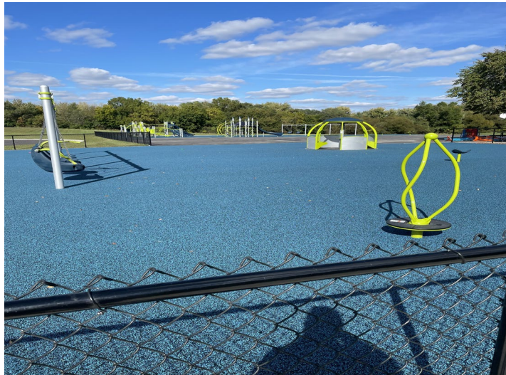
New Playground Soft Surface