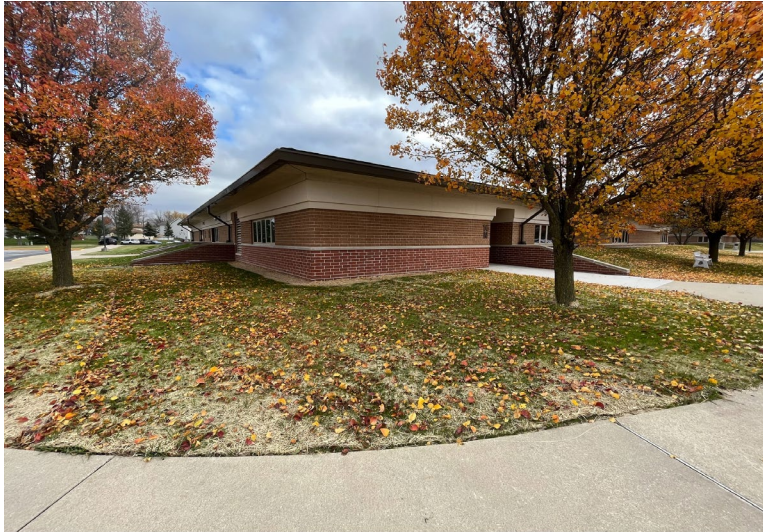
Classroom Addition Exterior Site Work