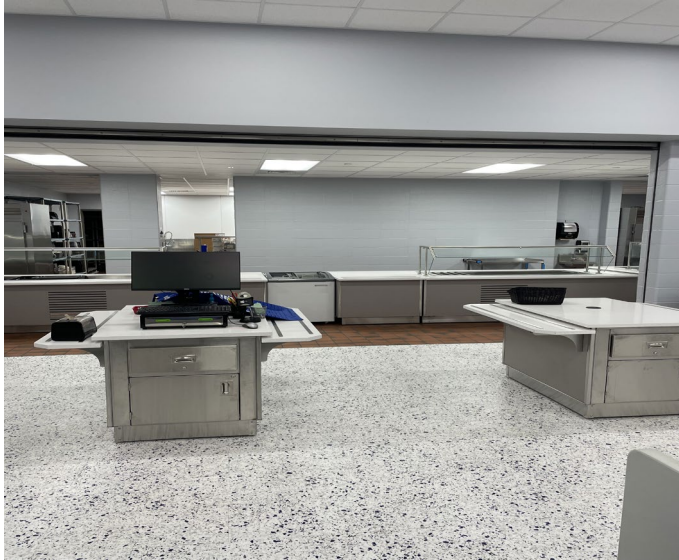
New Cafeteria Floor