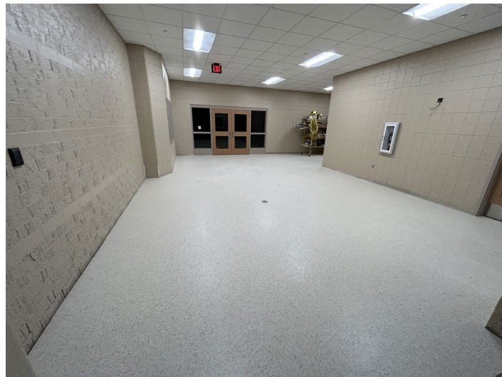
Unit T Corridor