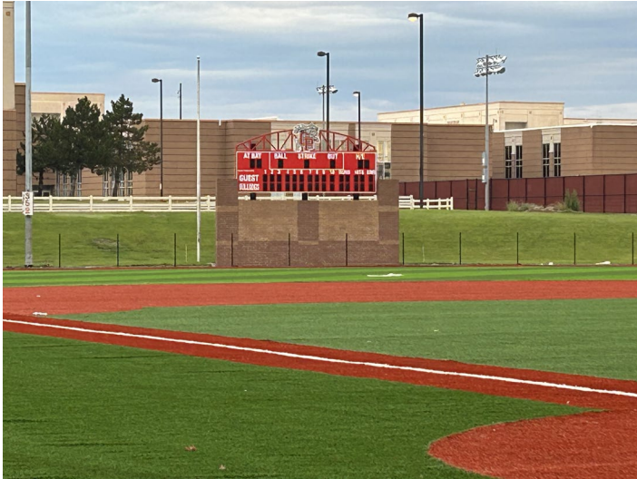
Varsity Baseball Field Scoreboard