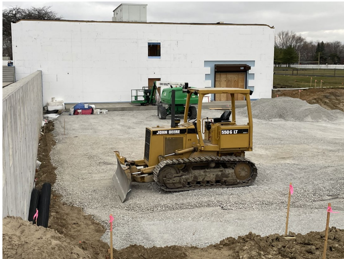
Lower Level of Education Center