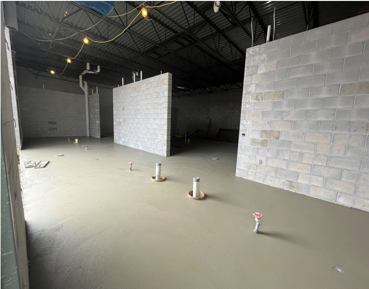
Kitchen Addition Interior