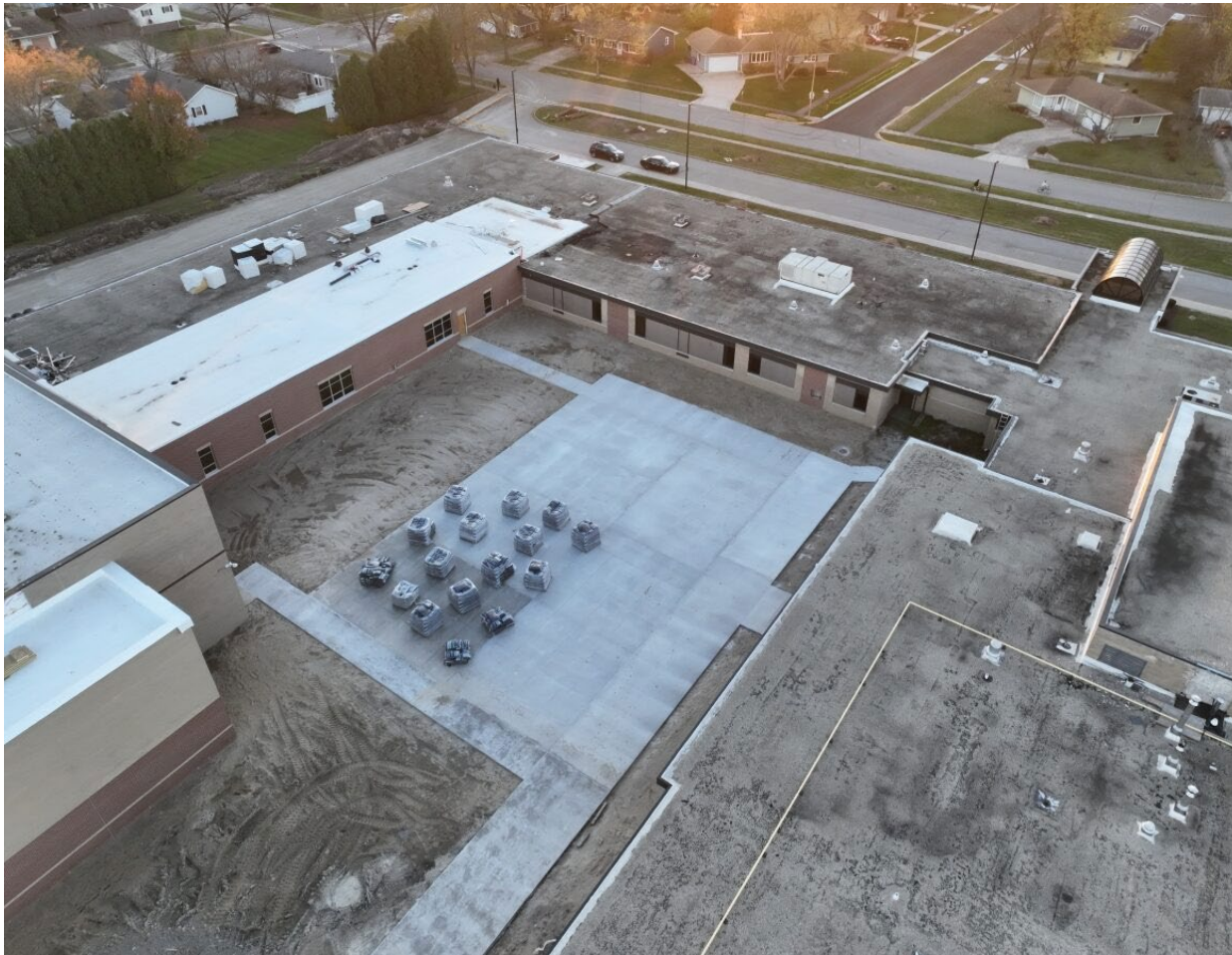
Courtyard Ariel View with New Media Center Addition