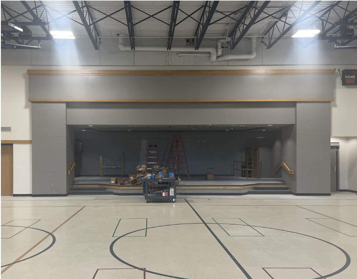
New Stage in Gymnasium