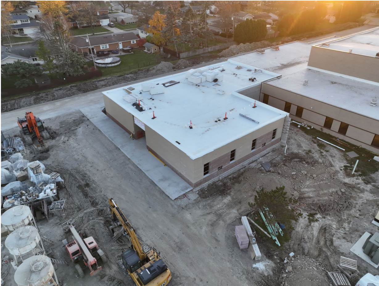
New Classroom Addition