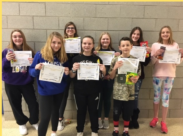
COWS from January 10th