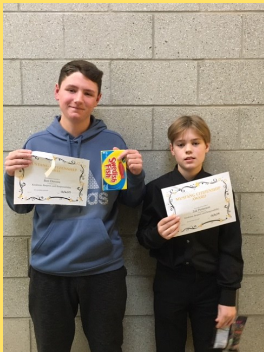
COWS from December 6th