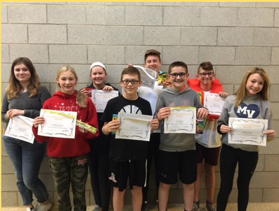
COWS from December 13th

Looking or a stocking stuffer for your student?